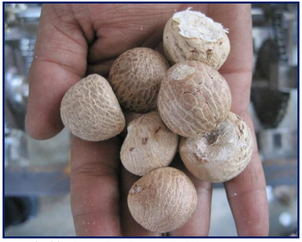
Fig.22 Photo showing peeled dry Areca nuts

three cutters making it suitable for Dehusking of three grades of Areca nut. Hence this machine has overcome the problems associated with the existing machines. After performing three experiments with different speeds and changing the number of cutters used, it can be concluded that the machine has an efficiency of 74% with single cutter at 125rpm.