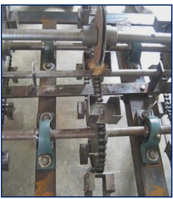
Fig.16 Setup showing experiment-1

In this experiments a set of two cutters with spacers inbetween for each grade of Areca nut were used. The speed of the cutter shaft was at 125 rpm. The Areca nut was fed below the cutters. As it can be seen from the images below, the outer shell of most of the Areca nuts fed was not being removed completely. Due to these problems the experiment was not satisfactory.