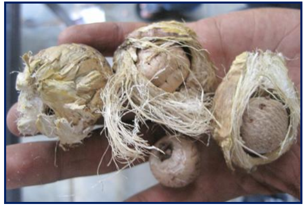
Fig.19 Showing the result of experiment-2