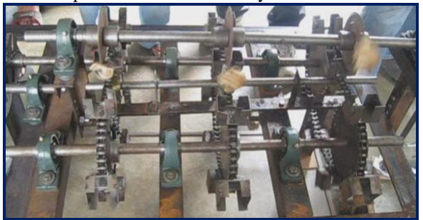
Fig.20 Setup showing experiment-3

seen that most of the Areca nuts were being Dehusked completely in this experiment. The results of this experiment was satisfactory.