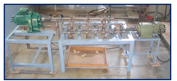
Fig.15 Complete assembly