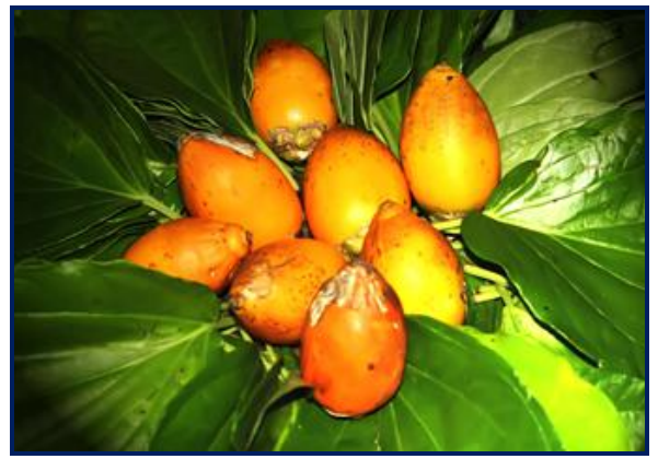
Fig.1 Photo of a ripened Areca nut

Andhra Pradesh, West Bengal and Orissa are the other important producing states. Mumbai, Ahmadabad, Indore, Jaipur, Delhi, Nagpur, Patna, Calcutta, Cuttack, Mangalore, Bangalore, Rajkot, and Chennai are the important marketing centers of Areca nut in India. Total consumption in India is estimated to be 330,000 ton per year. India also exports limited quantity mainly in the form of pan masala, scented supari and gutkha.[5-6]