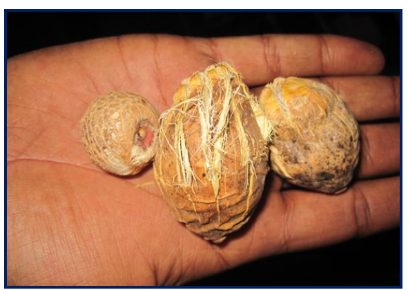
Fig.17 Showing the result of experiment-1