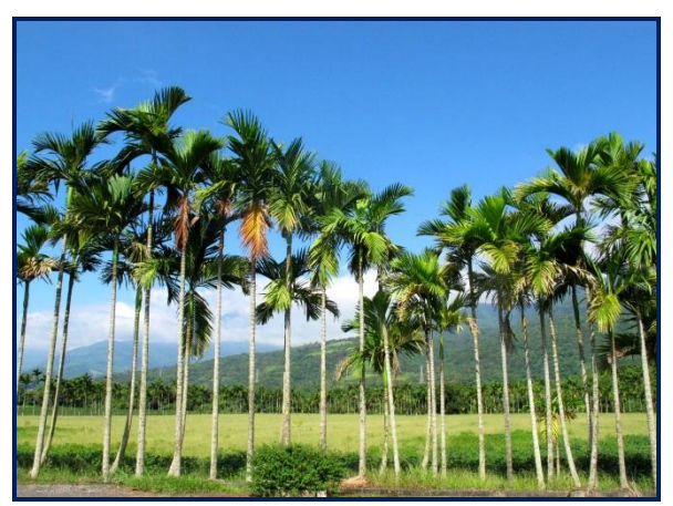
Fig.2 Photo showing Areca nut trees

Karnataka is the major producing state in India. In Karnataka, Areca nut is cultivated as a garden crop. Areca nut is mainly produced in Shimoga, North Canara, Dakshina Kannada, Udupi, and Chikmagalore districts. In four decades area under Areca nut was tremendously increased that is nearly 400 times. More than 2 lakh farmer families are involved in the Areca nut cultivation. Areca nut could provide an assured employment to the extent of one crore man days annually.[7-8]