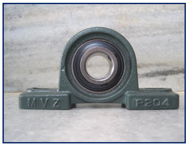
Fig.14 Photo showing Plummer Block